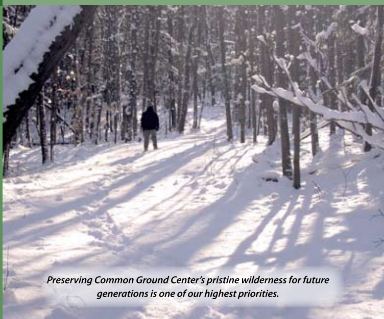
Preserving Common Ground Center's pristine wilderness for future generations is one of our highest priorities.

⇒ printed on 50% recycled paper offset by windpower on a waterless press