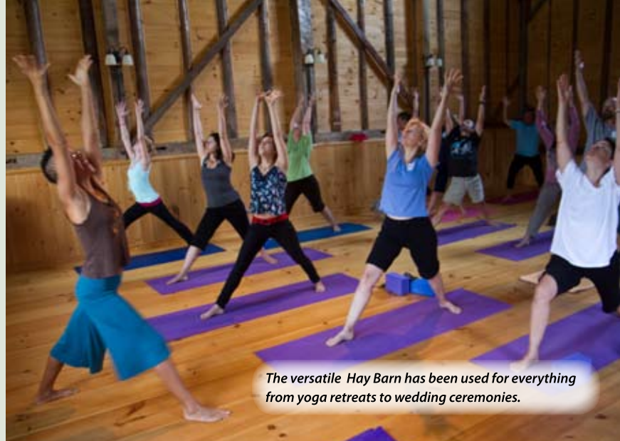
The versatile Hay Barn has been used for everything from yoga retreats to wedding ceremonies.