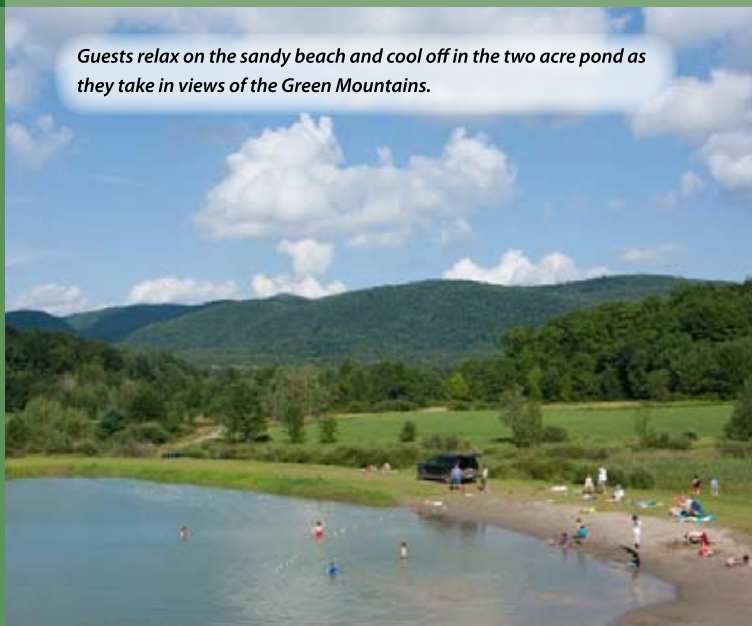
Guests relax on the sandy beach and cool off in the two acre pond as they take in views of the Green Mountains.